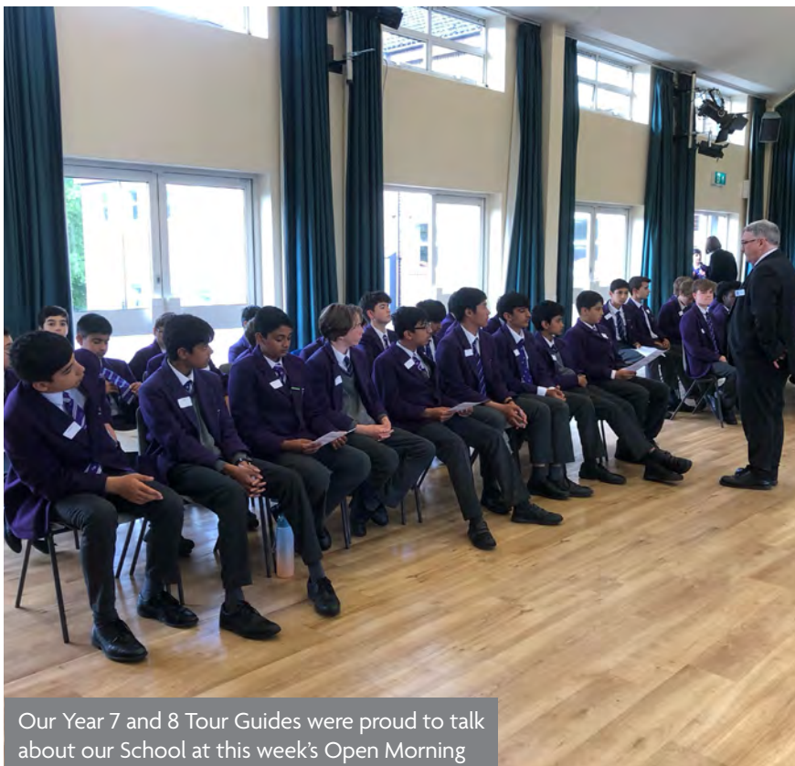
Our Year 7 and 8 Tour Guides were proud to talk about our School at this week's Open Morning