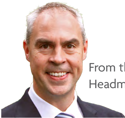
From the Headmaster

This week we proudly welcomed many visitors to St John's. The sun shone for Open Morning on Wednesday where our Year 7 and 8 boys served as wonderful ambassadors