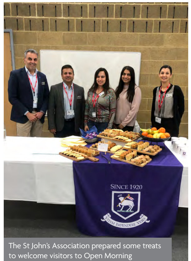
The St John's Association prepared some treats to welcome visitors to Open Morning