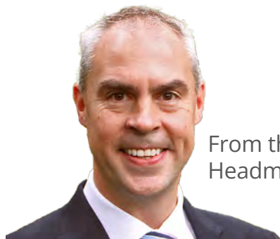
From the Headmaster

Autumnal greetings on our final day of what has been a fantastic half term. It has been a typically busy St John's week. Our annual Hunter Jones Poetry Recital Competition Final took place on Monday; on Wednesday our Year 5 boys enjoyed a full day of co-curricular interactive learning about life as an evacuee in World War II; Junior boys planted Spring bulbs in our Wellbeing Garden and Pre-Prep children sang and performed beautifully in front of parents at our Harvest Festival, as we raised funds and food donations for City Harvest. We were also pleased to announce new positions of responsibility and congratulate the boys who were awarded with these important roles. We hope you will enjoy this photographic record of our week. I also hope that all boys have a good rest, spend time with their families and read some interesting books over the coming days.