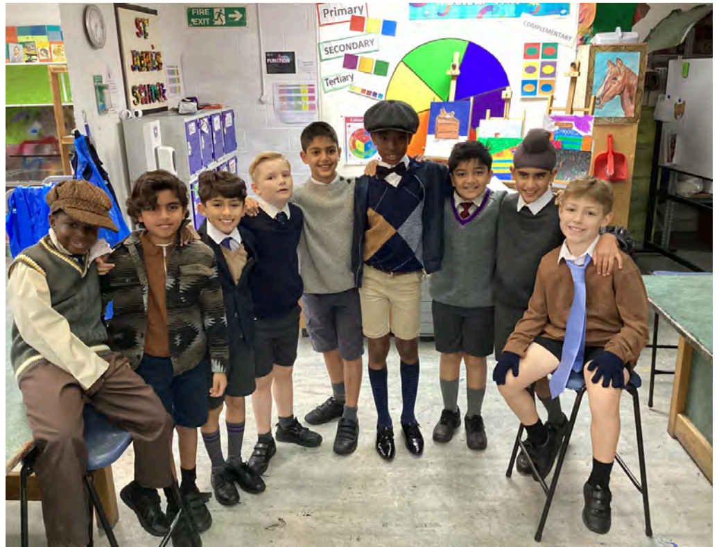
5 Endurance evacuees looking forward to their exciting day