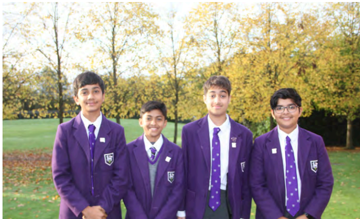
Votes for Schools Ambassadors