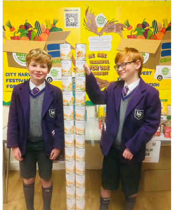
These boys measured themselves in baked beans when they brought their Harvest donations in - almost 13 large tins tall!