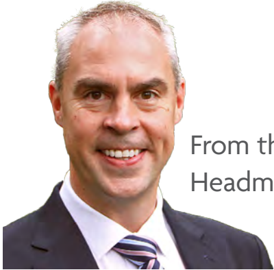
From the Headmaster

On Thursday, the Year 8 boys were inspired by a very special trip to Bletchley Park. On the 80th anniversary of the D-Day operation on June 6th 1944, they learnt about