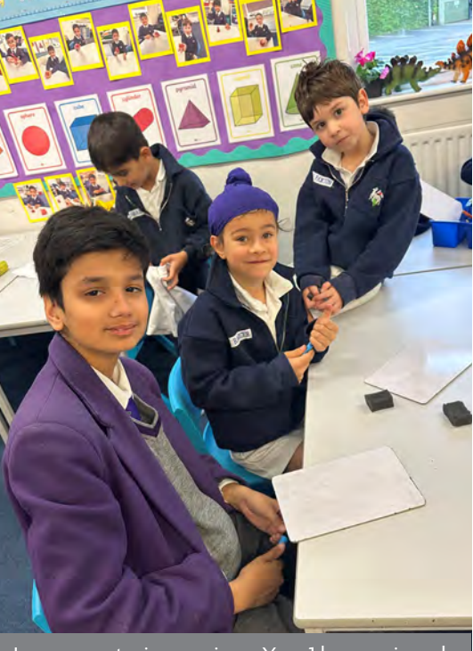
In our mentoring sessions, Year 1 boys enjoyed reading, drawing and chatting with Year 8 boys.