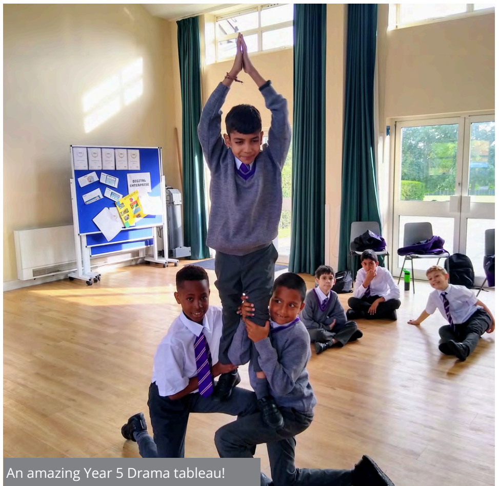
An amazing Year 5 Drama tableau!